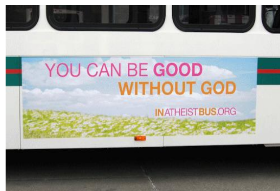
Second Proposed HSSB Ad