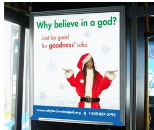
First Proposed HSSB Ad

I certainly hope there are no more “mistakes” but let’s all watch the bus advertising, keeping in mind Reagan’s famous policy, “trust, but verify.”