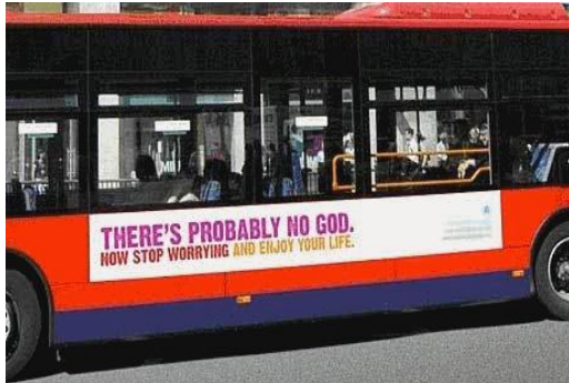
London Bus Sign

In October, 2008 a series of advertisements appeared on London buses with the support of the British Humanist Association and Richard Dawkins. The original goal was to raise £5,500 with Dawkins promising to match each pound raised up to the £5,500 goal. They were too modest; by the time the ad campaign ended in April, 2009 they had raised over £153,000. The Board thought a similar ad campaign here in Santa Barbara would provide some good exposure for our group, so I approached the MTD with an ad modeled on ones being run in the Washington, DC metro as shown here. Our ads were rejected because the MTD stated policy prohibited ads for “liquor, firearms, politics and religion” although the formal, written policy did not mention religion. We weren’t particularly happy with MTD’s policy but at least religious ads couldn’t appear either.