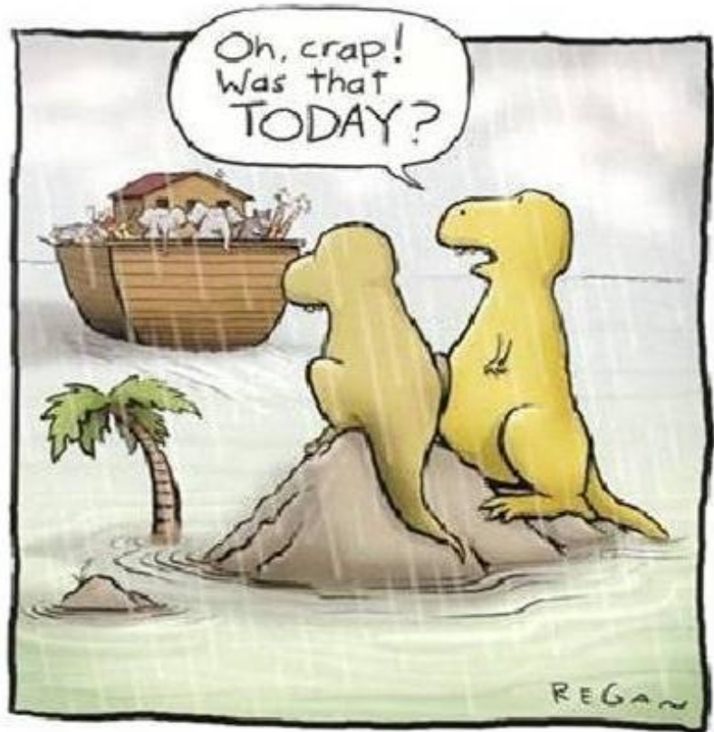
First Recorded Senior Moment